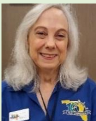
Governor Jonda Erwin