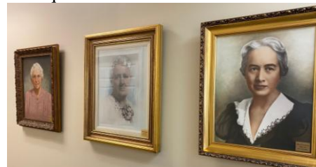
Portraits of women in Pilot history. 100 year charter & member manuals