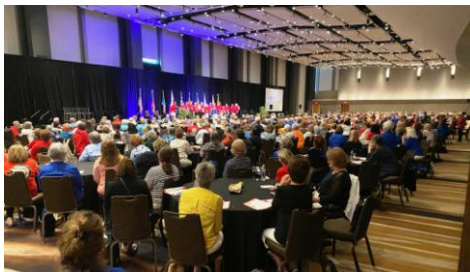
Pilot members gathered to celebrate 100 years of Pilot Friendship and Service. It was great to be together at the Marriott in Atlanta, GA.