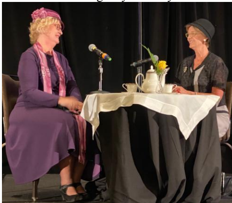
The skit of the historic day in Pilot.