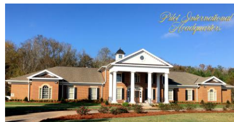
On my wish list to see Pilot International Headquarters. It was worth the wait.