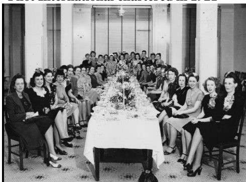
We've come a long way in 100 years