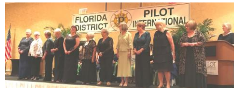
A tradition of the Installation is to pass the gavel from the Governors in the order that they served to the new Governor. This year, there were 10 Past Governors present for this ceremony.