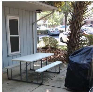
The Pilot Scholarship House Foundation

board voted to provide two picnic tables for the Williams House in Gainesville. They placed one near the patio under the peaceful shade tree and one on the patio near the grill.