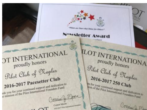
Several certificates were received by our club.